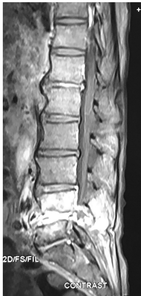
Fig. 1 MRI lumbosacral spine sagittal contrast T1-weighted image shows avid contrast enhancement