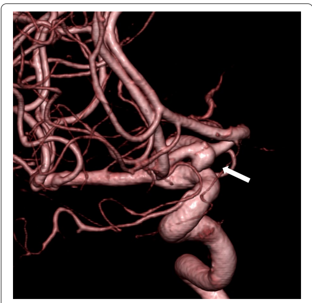
Fig. 1 Angiogram showing that the anterior communicating artery aneurysm had a maximum diameter of 5.1 mm with formation of blebs (arrow)

We present a case of scintillating scotoma with an unruptured AcomA aneurysm. Scintillating scotoma is commonly associated with migraines, with a potential mechanism involving cortical spreading depression [2]. Cortical spreading depression is a slowly propagating wave of neuronal and glial depolarization. Shams et al. also reported several cases of migraine-like visual aura secondary to cerebral lesions, including infarction, arteriovenous malformations, and tumors [3]. In that study, the lesions were located in the occipital lobe, which contains the primary visual cortex. The propagation of spreading depression through the visual cortex will create similar visual phenomena, whatever the original cause [3]. In our